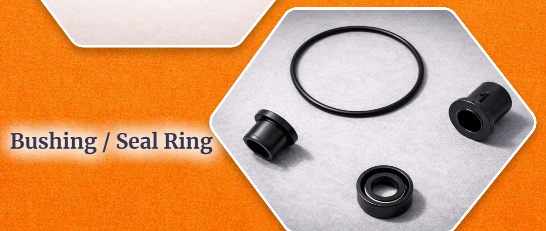
Bushing / Seal Ring