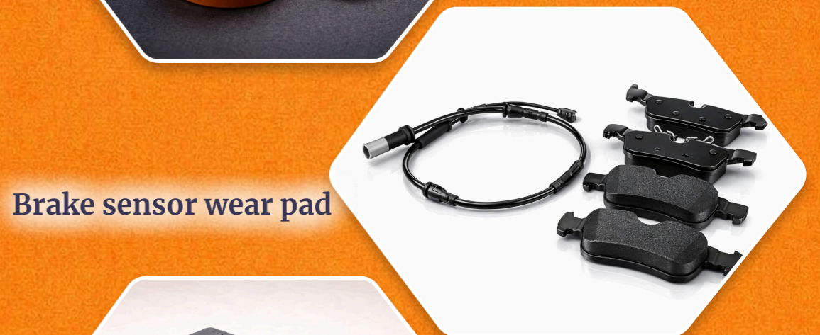
Brake sensor wear pad