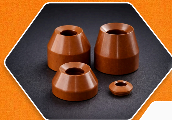
Insulation seal Cap