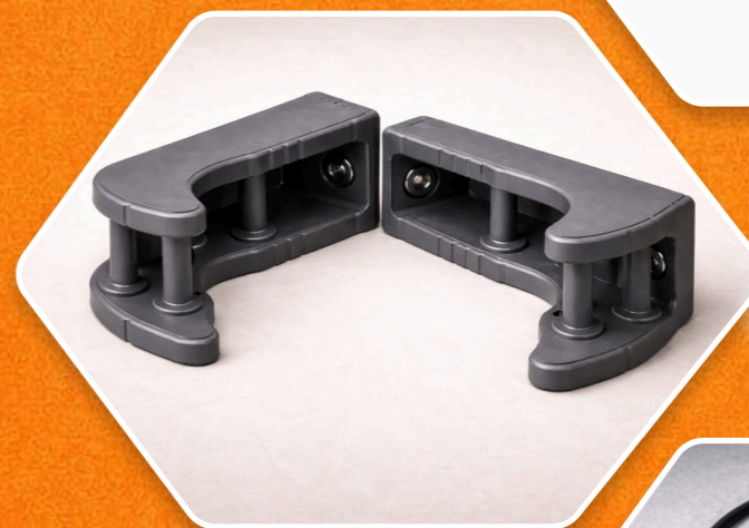
Glass Bottle Gripper